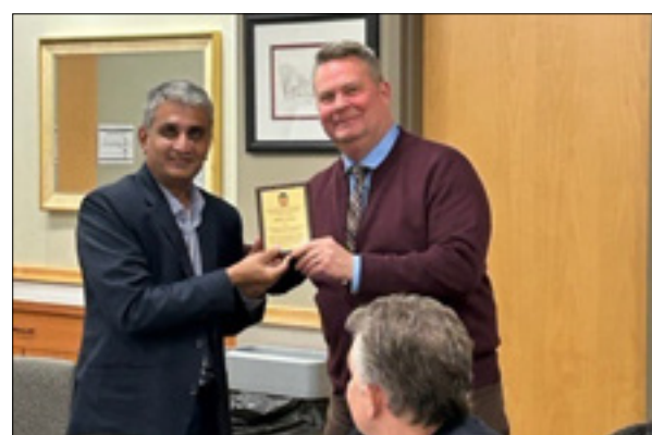
2023 award presented to College of Business.

For more information about the ACM designators in MyNIU and the Leading Impact Program, visit the Open Education website