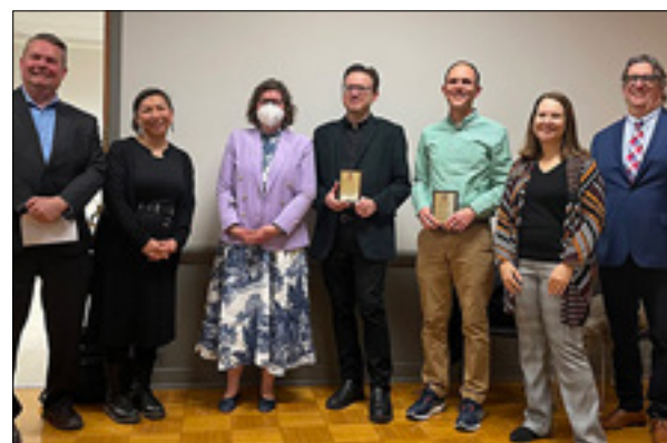
2023 awards presented to College of Liberal Arts and Sciences, Department of Philosophy and Department of English.

Thousands of students are already benefitting from these efforts, and these departments' continuing commitment will mean thousands more will benefit in the future.